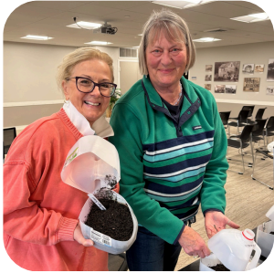
Winter Sowing Workshop Participants