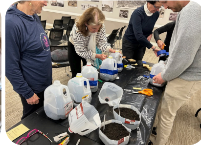
Winter Sowing in progress