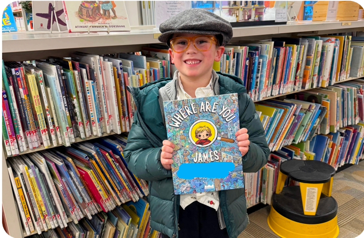
1000 Books Before Kindergarten Completion!