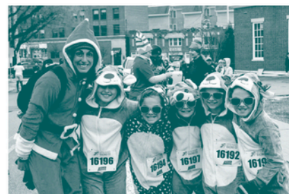
All proceeds benefit Radnor Memorial Library